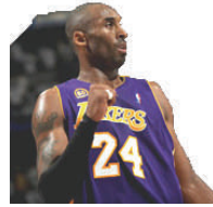
Kobe Bryant 2008 MVP